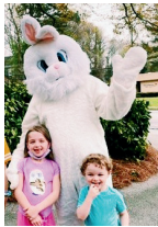
So much fun!

Join us for our annual Easter egg hunt, Easter Bunny, Tiff's Treats Truck & more! Treat filled eggs & volunteers needed! Sign up here: bit.ly/egg-2024