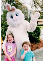
So much fun!